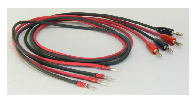
Evolution RTD Test Leads (Included)